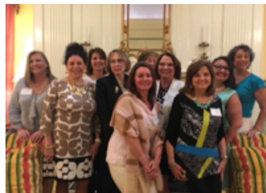
Members of KV 22 at Citywide Annual Dinner

Also thank you to all who worked our Spring Bunco and those who baked for our May bake sale at the hospital. Our small group gets big profits!