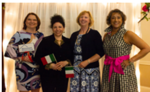
Passport to Fashion