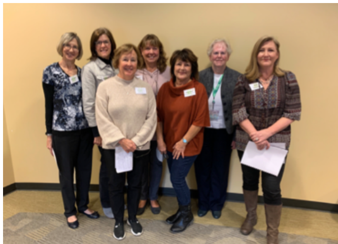
Presidents from North Region presenting at Leadership meeting