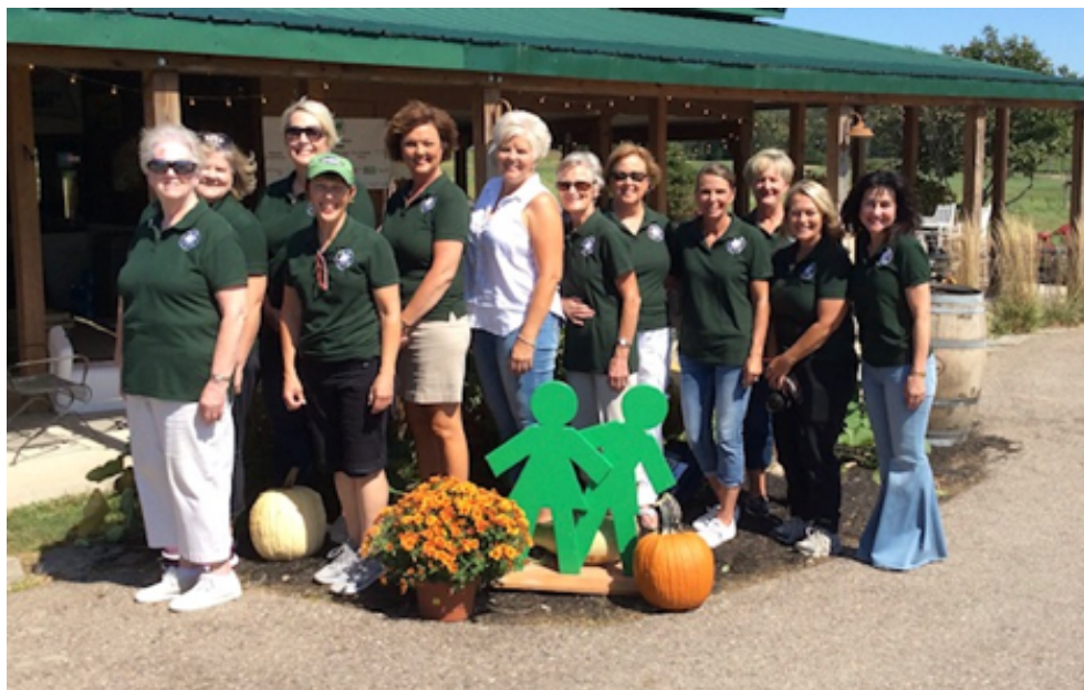
KV #12 and their 4th Annual Golf Outing at Majestic Springs Golf Club in Wilmington, OH, September 22.