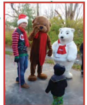
Animated characters and friendly elves welcome the children.