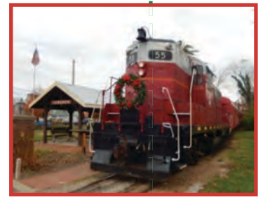
The Kindervelt North Pole Express, now in its 18th year.

For the past 18 years, literally thousands of families have enjoyed the tradition of rolling in the holidays on board the Kindervelt North Pole Express. For one day only, on the Saturday before Thanksgiving, November 19, Wyoming's Kindervelt Group #8 will again host this fun event, with the vintage train departing from the Lebanon Mason and Monroe Station in historic Lebanon.