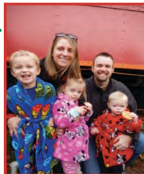
PJ's and/or comfy robes are welcome on all rides, even for the adults!