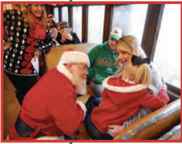
During the 45-minute ride, each child has some one-on-one time with Santa.