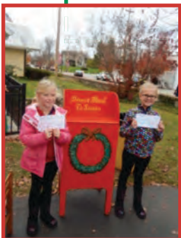
Many enjoy the letter writing station and the direct-to-Santa mailbox.