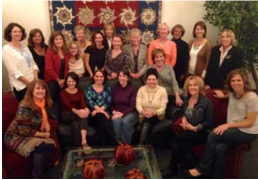
Members at St. Barnabas Church after a delightful dinner, business meeting and an evening of camaraderie.