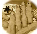
Witch's finger cookies