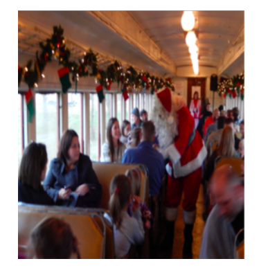
Each of the four cars is a party unto itself, with the book Polar Express being read, carols being sung, and Christmas wishes being shared with Santa

TICKET SALES BEGIN OCTOBER 1. DON'T WAIT TOO LONG – THE RIDES SELL OUT!