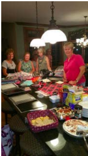
Kindervelt #78 having fun working on Market crafts.