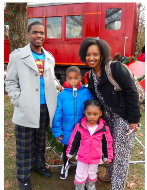
The Riley family from Sharonville were excited about their first ride on the festive holiday train in 2014.