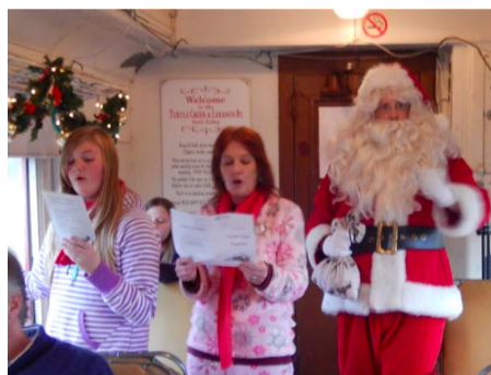
On the 45 minute rides, a storybook reader, elves, and Mr. C. himself provide plenty of entertainment.