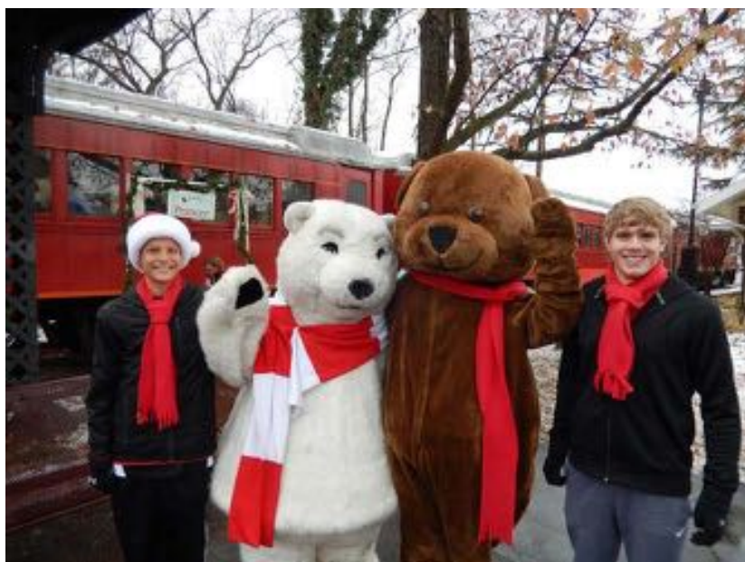
The two bears were enormously popular! Youth volunteers were priceless!