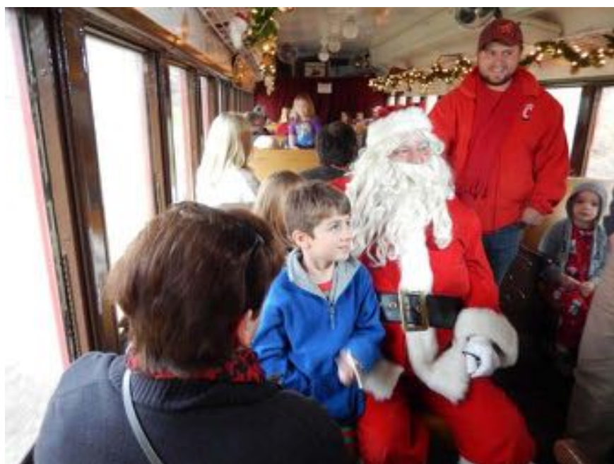
Each child had the opportunity to visit with Santa during the ride.